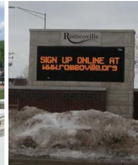
MUNICIPAL CENTER GATEWAY SIGNAGE