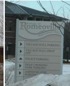
MUNICIPAL CENTER WAYFINDING SIGNAGE