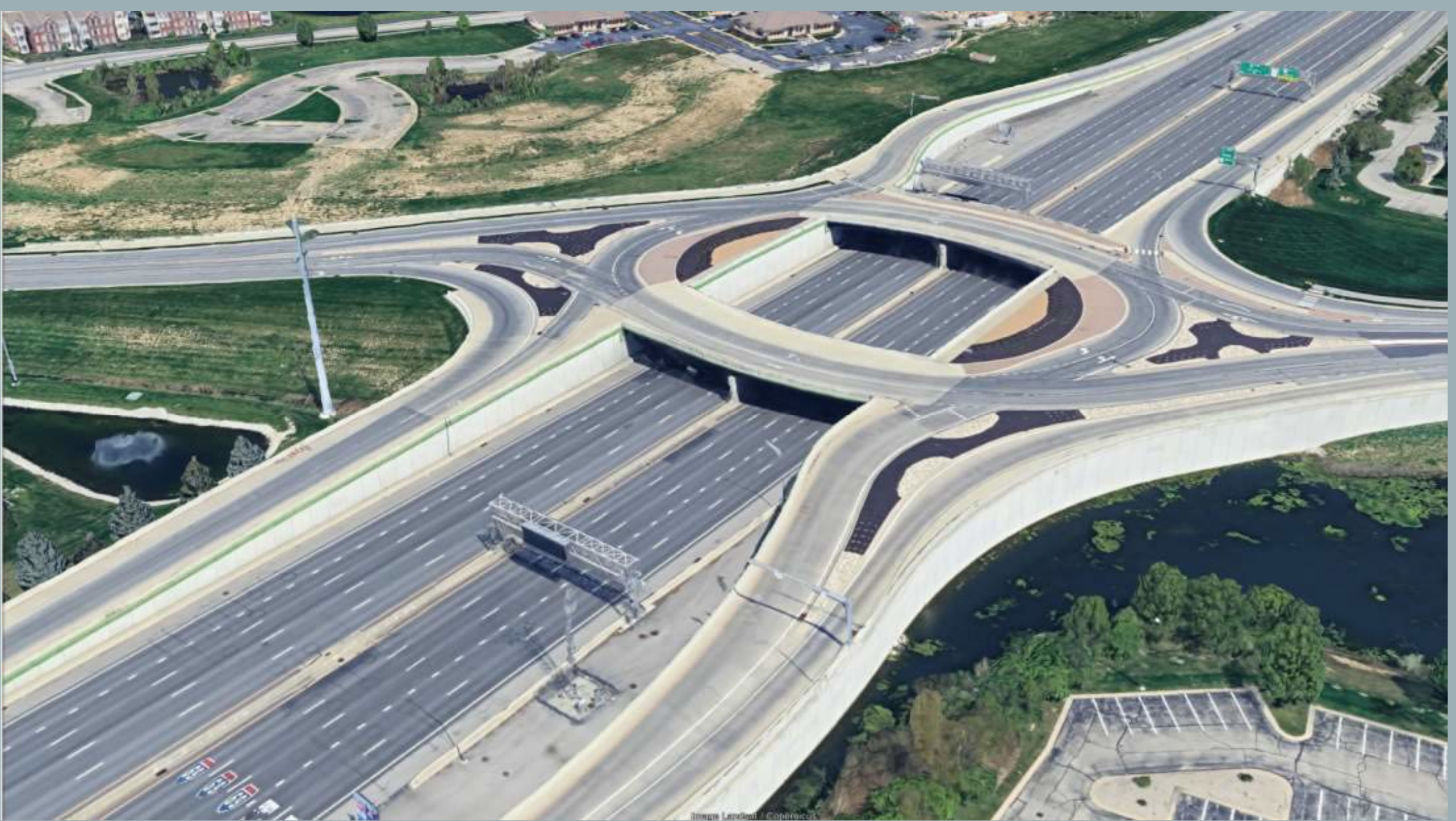
EXAMPLE: I06 TH ST OVER I-69 N/O INDIANAPOLIS